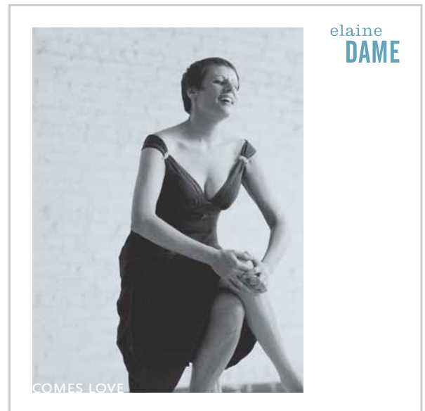
COMES LOVE 2005